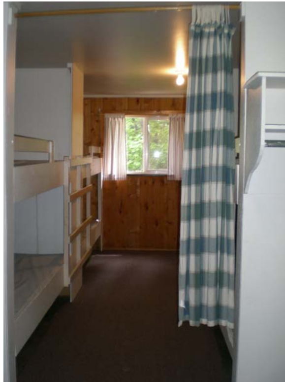
Camp Koinonia offers cabins and camping. This picture shows a view of the interior of one of the cabins.

Throughout the instruction, the class worked with a lot of maps. We examined well-designed courses from previous events, sketched some legs on a Cle Elum map, and broke into groups for some full-fledged course-setting on the Magnuson Park map. Each group tackled a different skill level (beginner, intermediate, advanced) and went outside and set the markers. Members from the other groups tested the courses and provided