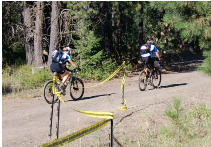
Mountain biking is a fun component of the Six Degrees of Navigation Adventure Race.

Mountain biking! Orienteering! River Trekking! And best of all: navigating!