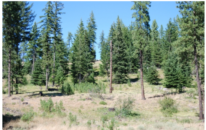
The Six Degrees of Navigation Adventure Race takes place in the beautiful terrain of the Teanaway Valley.